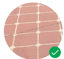
STENCILLED OR STAMPED CONCRETE