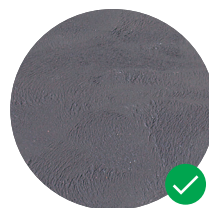
SEALED OR PAINTED CONCRETE