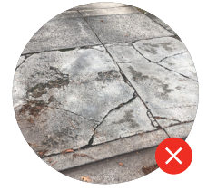
SUPERFICIAL CRACKS OR DAMAGE